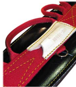
Sewing Sample with multiple plies of leather and nylon

Vernon Weaver: "The 205-370 is an excellent sewing machine, but with the extended 205-370-40 with a 16 inch arm clearance we now have a machine that fits the needs of our business even better.